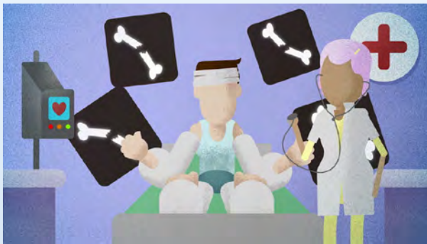
New advertising spot on the importance of metals and minerals in medicine