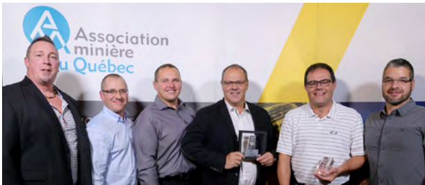
ArcelorMittal Mining Canada