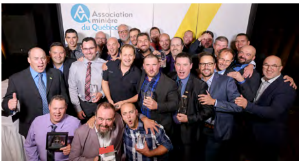
Canadian Malartic G.P., Canadian Malartic Mine