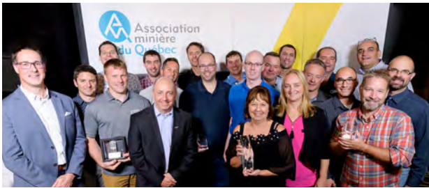
Horne Smelter, a Glencore company