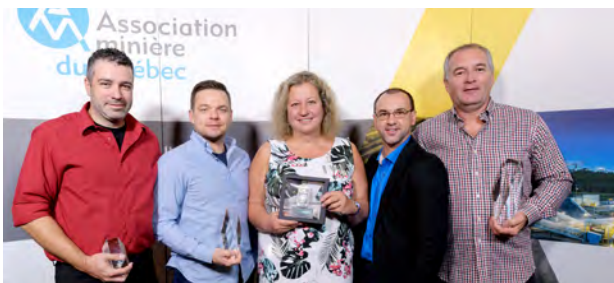
Niobec, a Magris Resources company