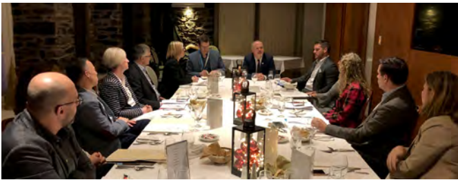
Above: Discussion with Minister Benoît Charette on environmental issues in the industry