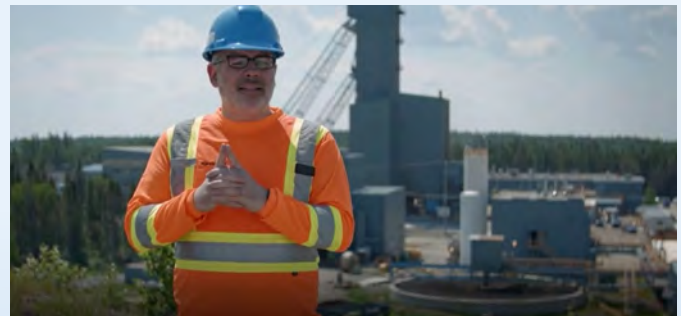
Shooting of Génial! at the LaRonde Mine