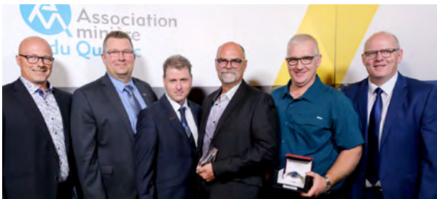
Raglan Mine, a Glencore company