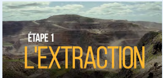
«La route du fer» video