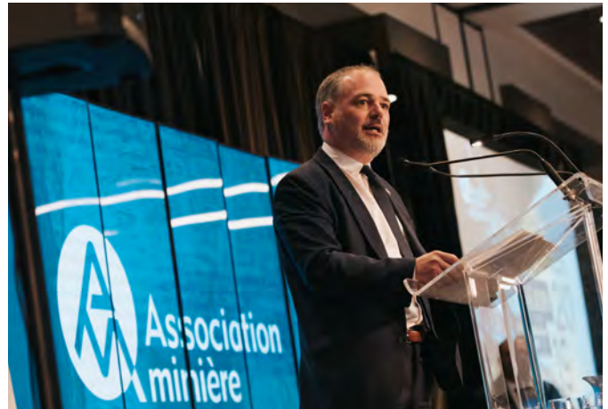
Above: Jonatan Julien, Minister of Energy and Natural Resources, at the 2019 QMA annual convention