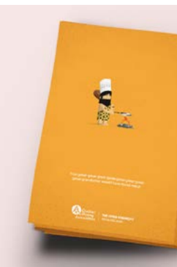
Postcards and advertising in the colors of the campaign The inner strength